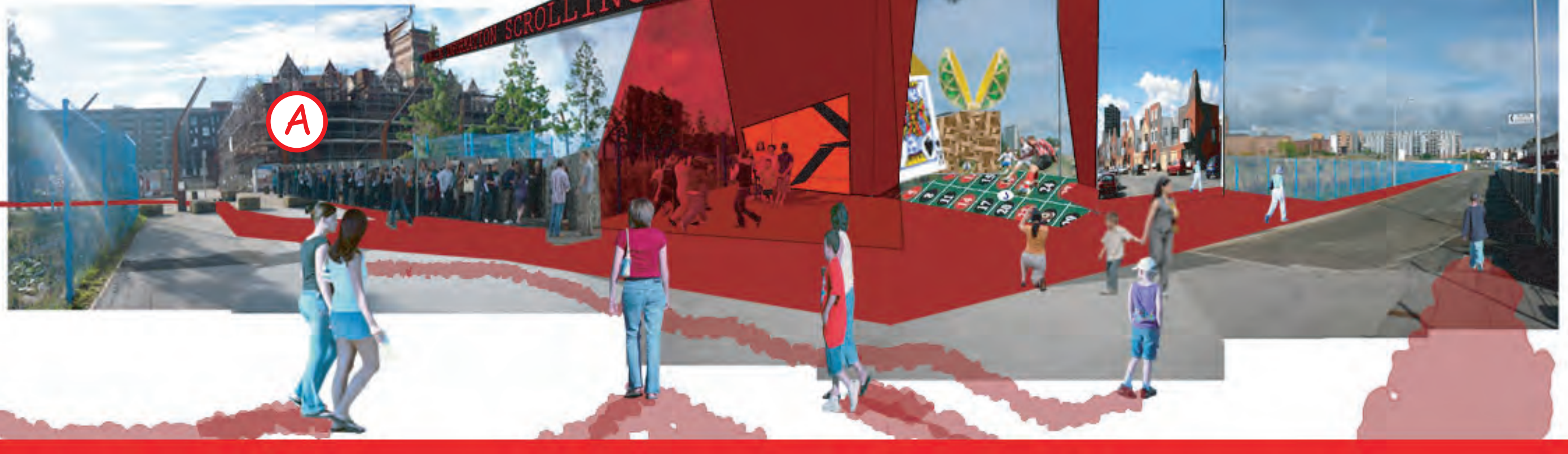
VIEW FROM WEYBRIDGE ROAD